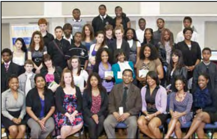
2011 Change Your Future student award winners.

Change Your Future is an innovative mentorship program giving students from culturally diverse backgrounds the help and opportunity they need to stay in school and positively change their direction. In 2010-2011, 600 students (grades nine to 11) from 24 schools in six school boards and districts across the Greater Toronto Area and in other areas of Ontario, participated in Change Your Future . In May 2011, students who achieved the most personal and academic growth were honoured at the annual Change Your Future awards ceremony. Seven qualifying students received Change Your Future scholarships through the support of the RBC Foundation in 2010-2011.