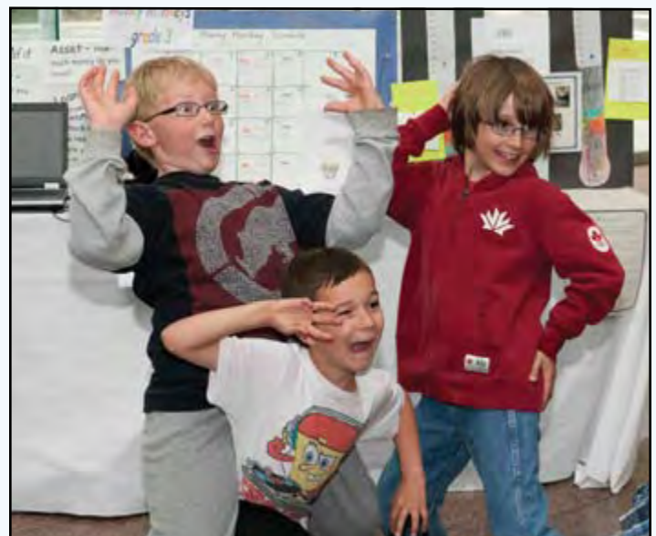
Excited young students participating in The Learning Partnership's Entrepreneurial Adventure program.