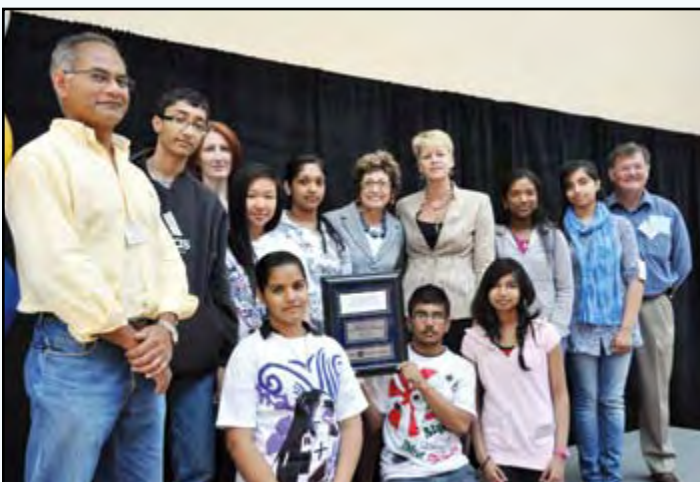
Toronto District School Board students who were winners in the 2011 BMO Financial Group National Student Innovation Awards .

In Entrepreneurial Adventure , students from Kindergarten to Grade 12 learn business and critical-thinking skills giving them a foundation for future success. The program instills both entrepreneurial spirit and a sense of social responsibility through developing ideas into real fund-raising business ventures. In the 2010-2011 school year, 3,750 students in Calgary, the Greater Toronto Area, Simcoe, Ont., Ottawa, Fredericton, Saint John and Halifax participated in creating 88 ventures raising over $70,000 for charitable organizations. Twelve groups of students received BMO Financial Group National Student Innovation Awards in teamwork, enterprising spirit, impact on school or community, originality and judges' choice categories. Since 1995, more than 34,000 students have experienced Entrepreneurial Adventure and raised over $2.4 million for charities.