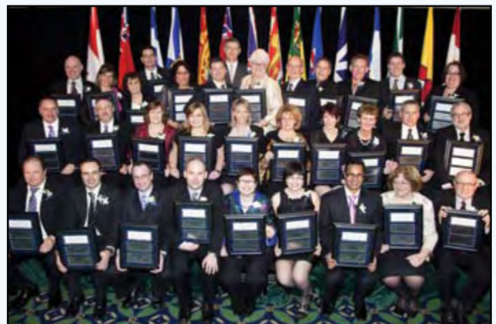
Canada's Outstanding Principals of 2011.