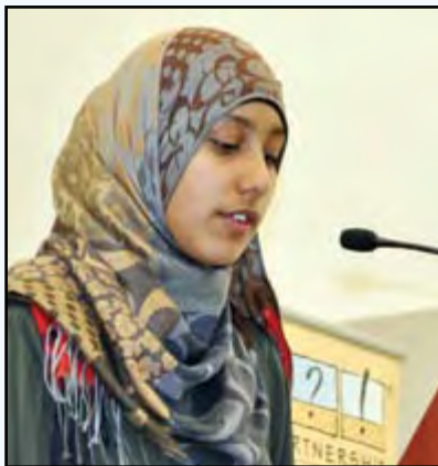
2011 Turning Points student award winner.

Turning Points is a character development and literacy program that helps students in grades six to 12 gain new self-insight while developing their literacy skills. The program, offered in both official languages, is provided in association with school boards in St. John's, the Greater Toronto Area, Brantford, Ont., Sudbury and Calgary. Students must write an essay about a critical point in their lives. In 2011, The Learning Partnership received over 11,500 submissions. A total of 428 judges selected 115 award-winning essays in English, French and aboriginal categories that were published in the 12th annual Turning Points anthology. Award winners were recognized at events in the spring of 2011.