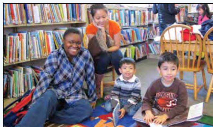
Parents and children at one of The Learning Partnership's Welcome to Kindergarten™ family orientation sessions.